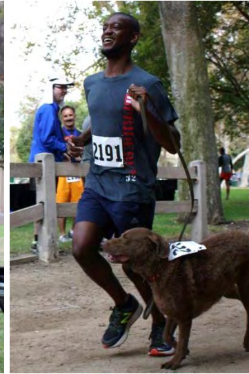
Angelo & Diesel