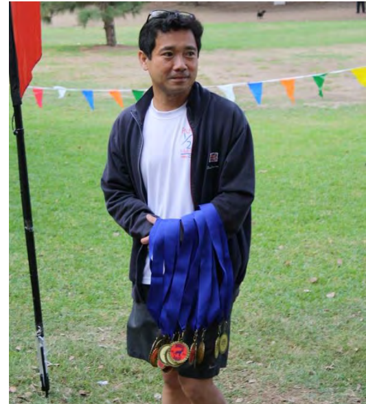
Miss Doggie Dash Medals