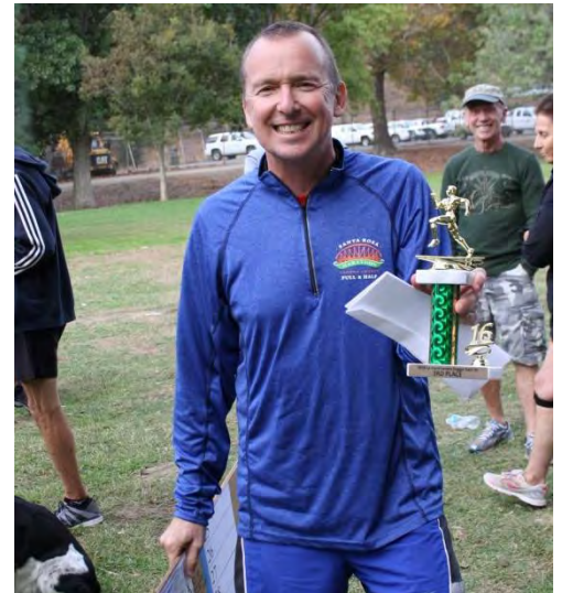
Angus: 3 rd OA humans only 5K