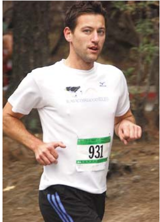
do you mind? i'm a little busy here...