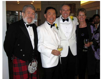
July: Marriage for All!