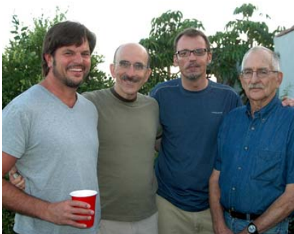
September: Men of Summer