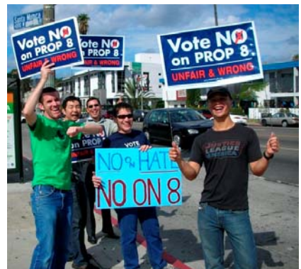
November: No on H8!

What adventures are in store for LAFR members in 2009? Your participation writes the story!