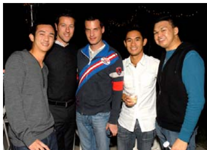
Don Thompson would be proud.

What adventures are in store for LAFR members in 2009? Your participation writes the story!