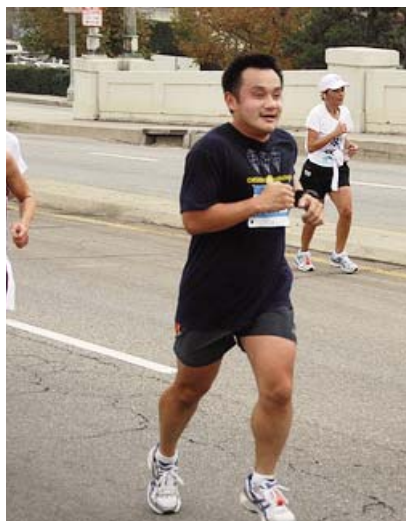
happy half marathoners

Note: This will be a 2009 LAFR Grand Prix race