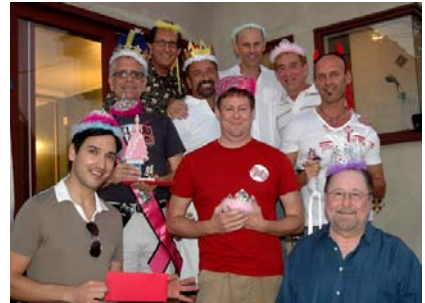
There can never be too many queens in this running/walking club