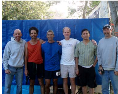
When 26.2 miles is just the warmup