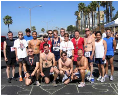
May: Long Beach Pride Run