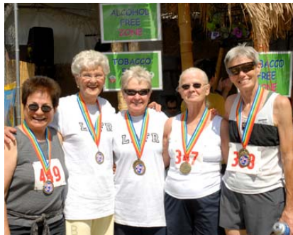
June: Pride Run