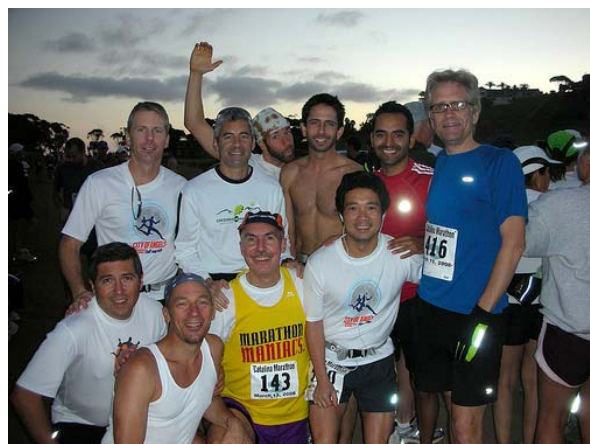
The start of another great Catalina Marathon weekend.