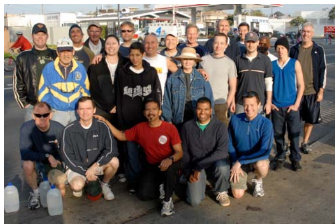
Frontrunners turn out in force to aid runners and walkers at Mile 12 Water Station. Did you see us on Channel 2 News?