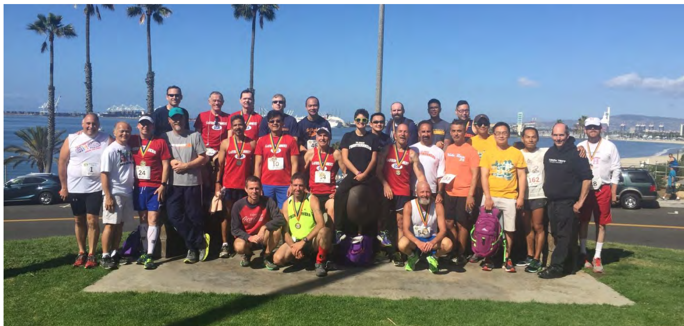
LA Frontrunners at the Shoreline Frontrunners Pride Run in May