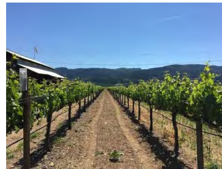
We lost count of the vineyards.