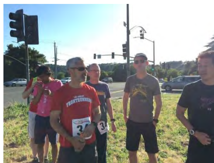
And more waiting.