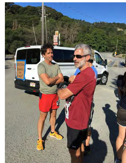
There was lots of waiting.