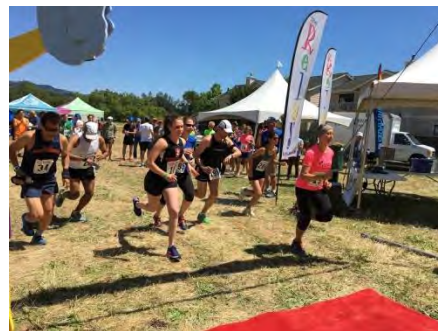
Top: The start!