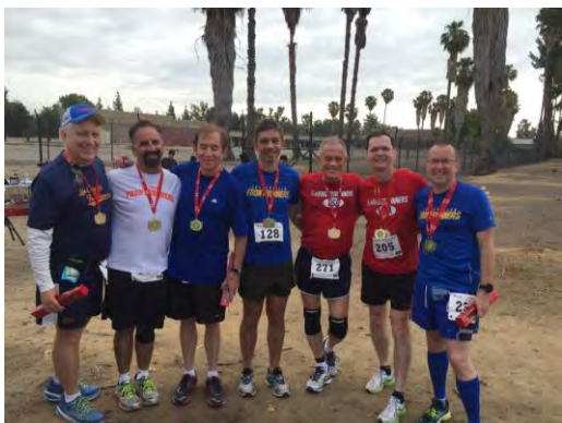
5/8 Mother's Day Race