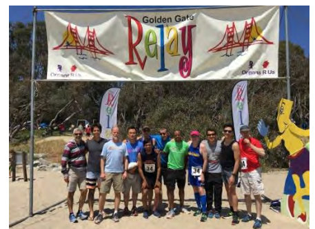
But the finish was glorious!