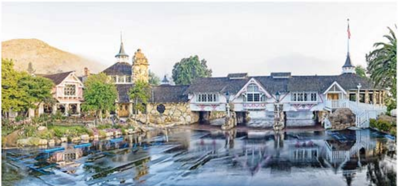
Madonna Inn exterior

Tour Four not only concentrates on the beauty of the botanical gardens, but also provides a glimpse into some of the less familiar aspects of Hearst Castle. Tour 4 includes the Wine Cellar of Hearst Castle, featuring rare European vintages and California wines and Casa del Mar where Hearst himself spent his final years of residence on the hilltop.