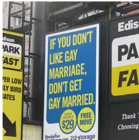
Above: If we were in NYC, we would use this storage company!