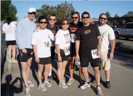
Several club members before racing. See p.10 for more