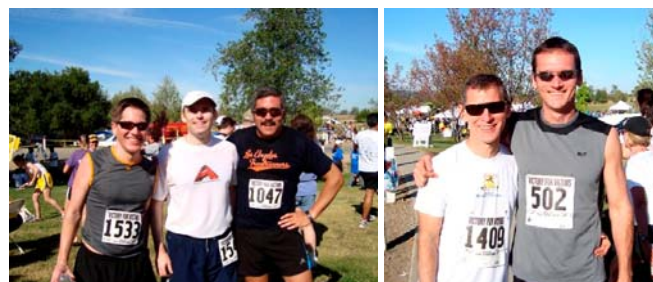
Could LA Frontrunners ask for better weather or better friends?