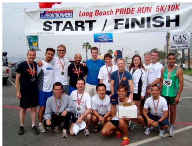
LA Frontrunners clean up at Shoreline FR Pride

We'll do it again in '10. That's not B-10, so hold your cards!