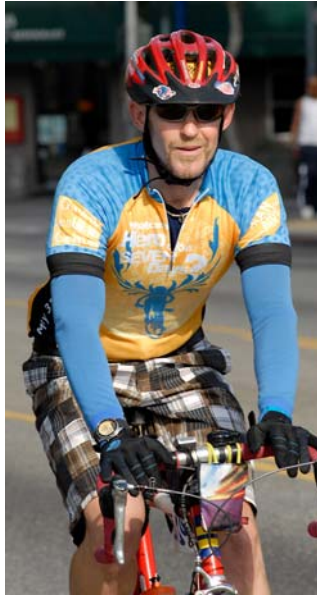
Ran: Lifecyclist & Race Pacer