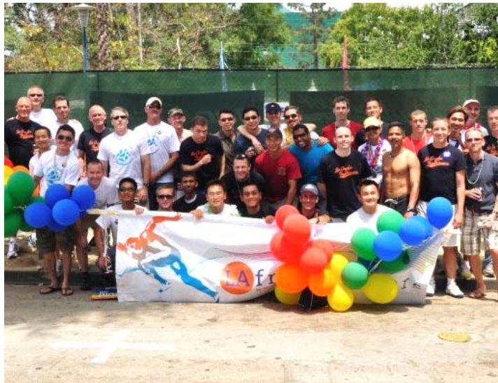
The best looking runners and walkers on the parade route