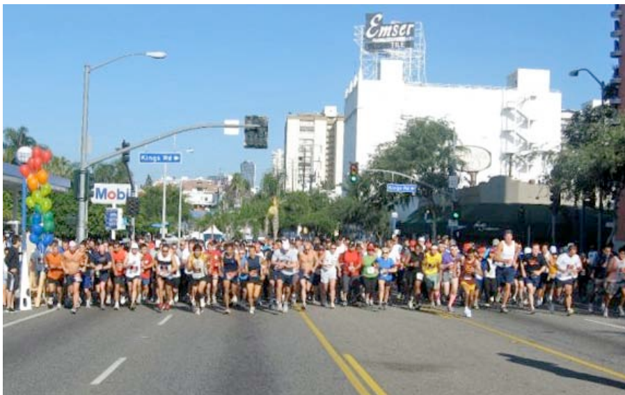
5K Pride Runners dash off moments after the sunny start