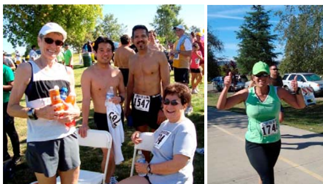
More pics from Victory for Victims Race

Well, this month’s Runner’s World may have solved our problem. The "I’m a Runner" profile on page 116 features Jennifer Beals (Bette from "The L Word") who says she runs the trails in Griffith Park! She even did a triathlon with Mia Kirshner (Jenny) and didn’t drown her! You can check out the full interview at: www.runnersworld.com/imarunner . See you on the trails, ladies!