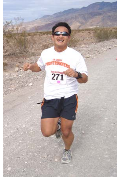
Left: LAFRRs at Marathon start