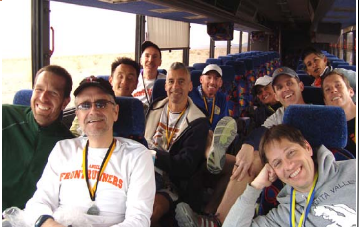
Right: Bus ride post-race back to the ranch