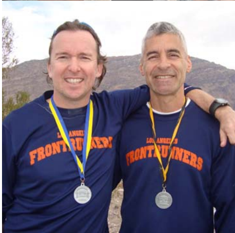
Above: FRs at 30K start