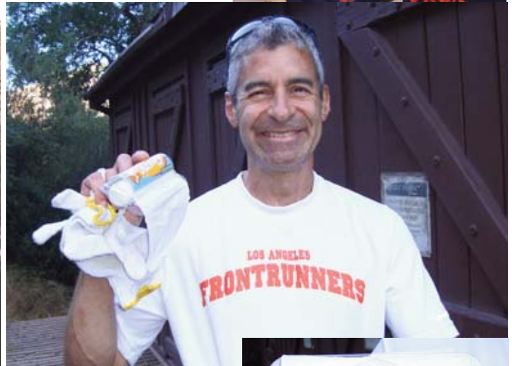
Above and right: Our fearless trail leader is always prepared