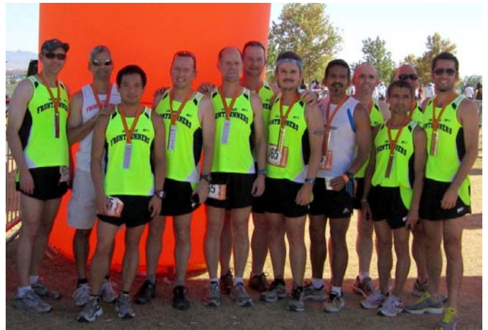
Right: Team LA Frontrunners at the finish line