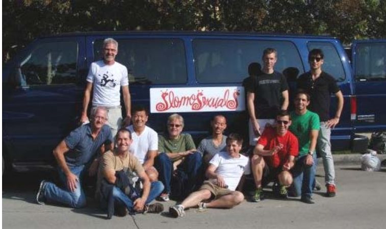
Above: Team Slomosexuals & their great van before leaving Los Angeles