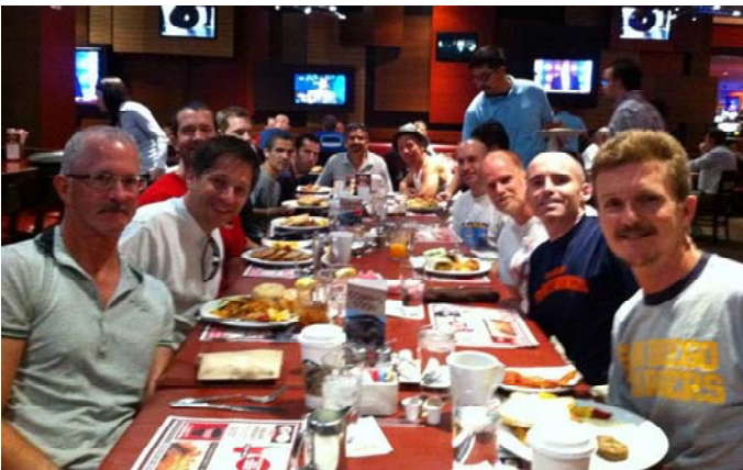
Above: the gaggle of gays having breakfast before heading back home to Los Angeles on Sunday