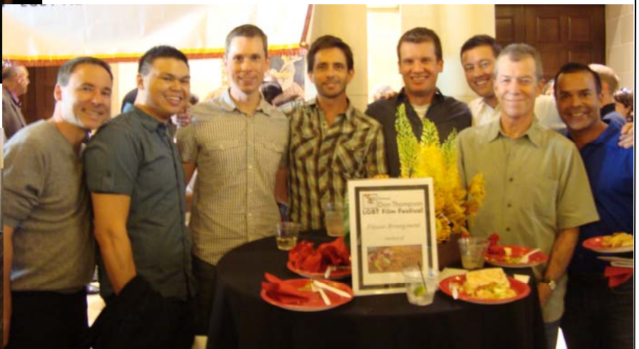
Above: A gaggle of LAFR guys at the Don Thompson LGBT Film Festival