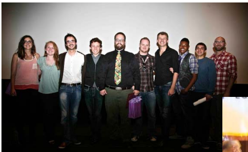
Left: 2011 Don Thompson Film Festival Filmmakers

Each year the scholarship is awarded to a student who has demonstrated a commitment to advance LGBT issues through their academic or creative work, community involvement, or by other personal contributions.