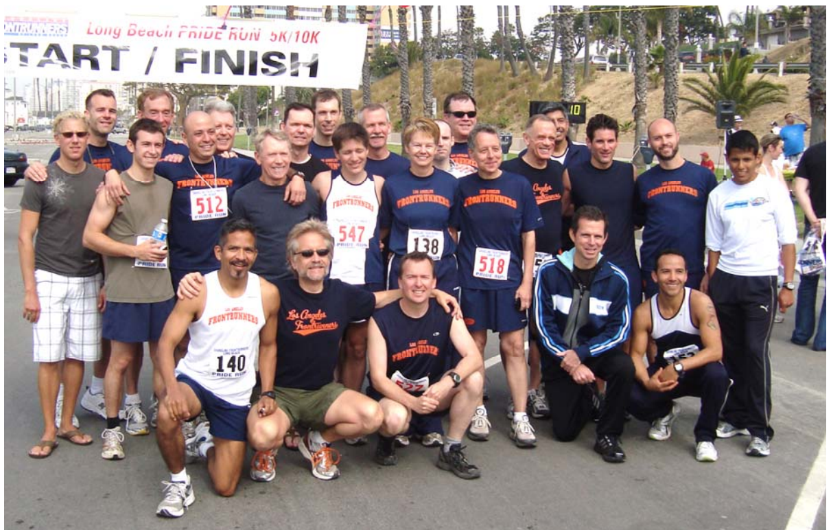
LAFRs at the 2010 Long Beach Pride Run

Kick off the 2011 Long Beach Pride weekend by participating in the 2011 Pride Run. All proceeds from the Pride Run are donated to Long Beach and Orange County youth, education, and health groups during the Awards Ceremony. Questions? Call our hotline at 562-252-0218, or send e-mail to priderun@shorelinefrontrunners.org