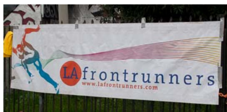
LAFR Banner at our water stop