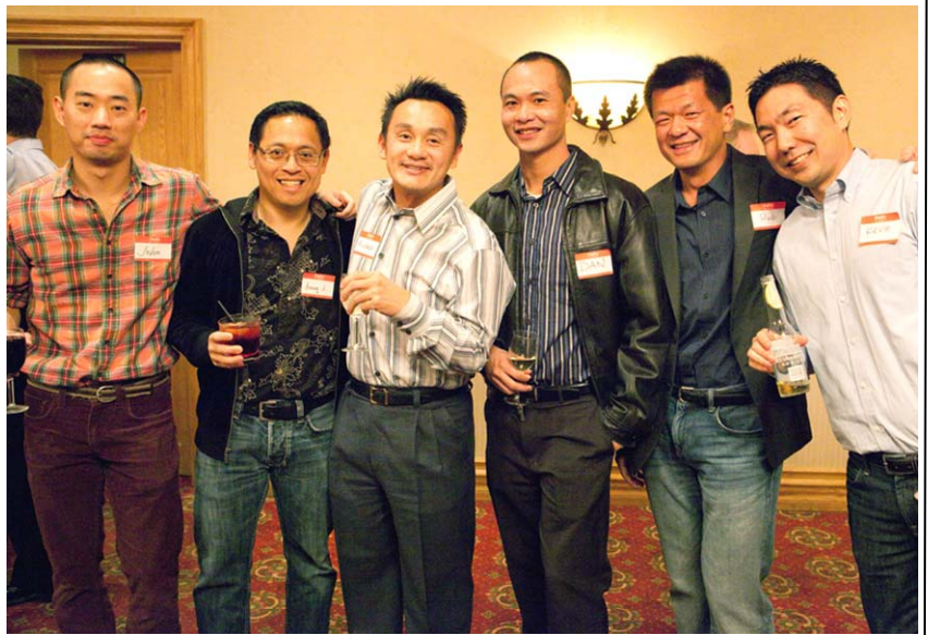
Above: The Oriental Fantasy and his royal court