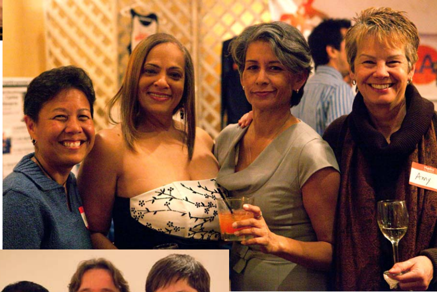
Above: The Ladies