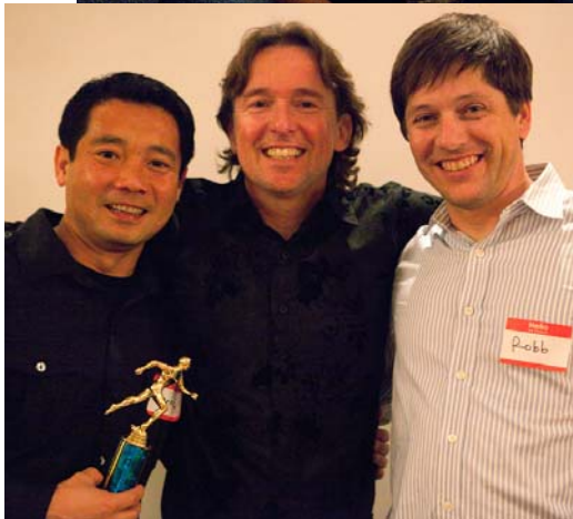
Top: Deo's dreams come true