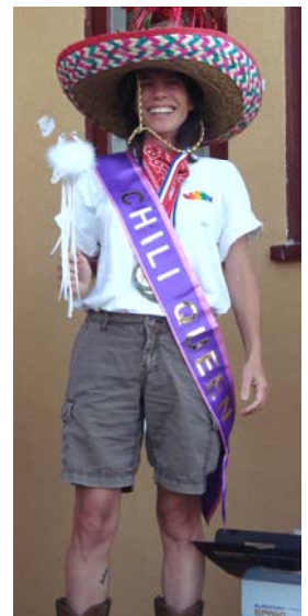
Above: Cat is crowned - Middle: Hottest Cooks