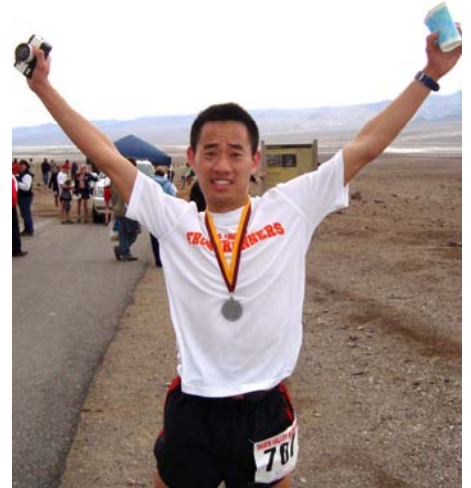
↑ This could be you

If you haven't run the Death Valley 30K or Marathon, here's your chance to run this exciting race with your fellow FRs. The marathon course begins w/ rolling hills through mile 8 before reaching the starting point of the 30K and continuing through spectacular Titus Canyon to the finish, dropping 5000 feet along the way. We'll head out to