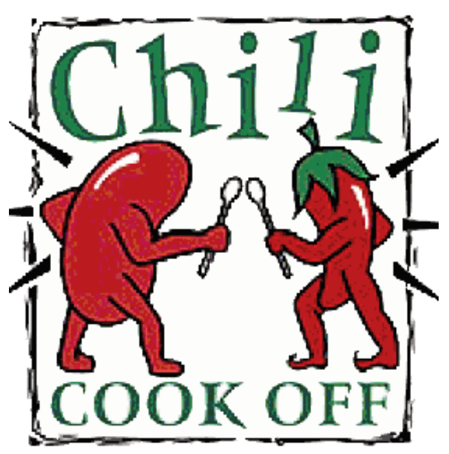
Tenth Annual LAFR Chili Cook-Off

LAFR Chili Cook-Off X October 10, 4:00 PM at Rusty's 850 Micheltorena St., LA, 90026