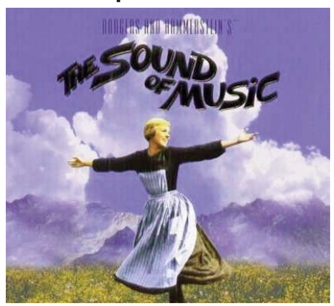
Sing-A-Long Sound of Music Saturday, Sept. 25, 2010 6:00 PM Pre-show 7:30 PM Film

The Hollywood hills are alive with The Sound of Music! Everyone's favorite sing-a-long returns to the giant screen at the Bowl – the world's largest outdoor movie theater. Bring your costume (for the pre-show parade) and warm up your vocal cords for this beloved event.